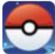
13. Pokemon Go!