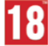
5. PEGI 18 / 18+ rating