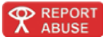
12. CEOP Button